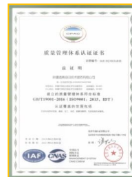
QHSE System Certificate