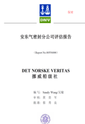
DNV Assessment Report

Since establishment, the Hermetic Seal Detection Branch has been continuously committed to technological progress. It is supported by a powerful expert team and a strict management system of safety and quality. 34 authorized patents help to form an intellectual property rights system. It drafts national standards. The safety and reliability of facility and technology has passed DET NORSKE VERITAS assessment (Report No. 80556000). Its ultra-high pressure vessel has earned China Special Equipment Use Certification (CNT-130).