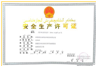
Company Safety Production License