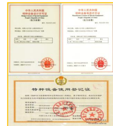
Ultra-high Pressure Vessel Certificates