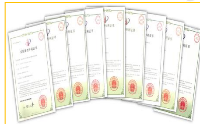
Certificates of patent